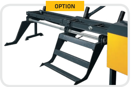
Telescopic hydraulic lifting table for logs up to 4000 mm.

In addition to easy maintenance, these features enable the machine to be used under harsh conditions.