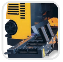
Driven in-feed rollers.