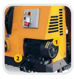
1. 15 kW electric motor. 2. Category II and III linkage.